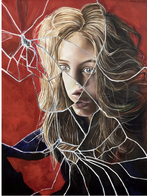
Shattered Reflections , acrylic painting by Ella Aretakis , 12th Grade