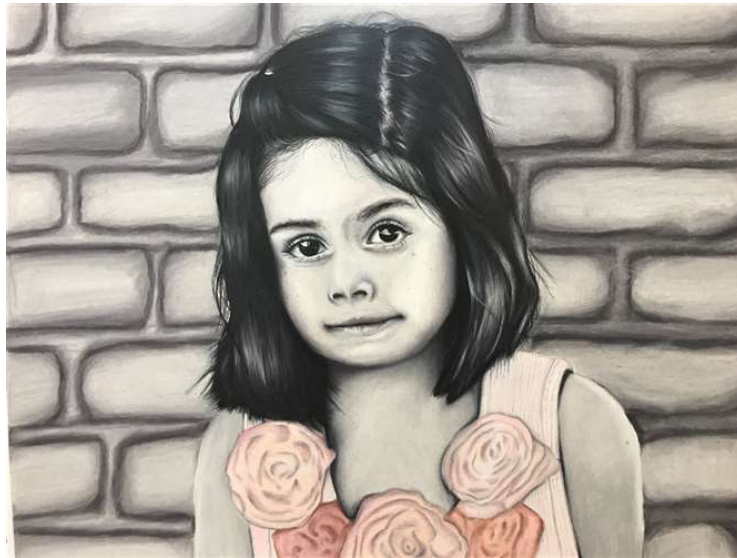
Sweet Innocence , colored pencil illustration by Alaina Novey , 10th grade